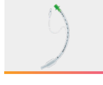
High volume low pressure cuff (HVLP)