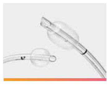
Provides a better seal due to advanced microthin polyurethane (PU) cuff that 'seals' channels to

The Avanos Adult MICROCUFF* Tube features the breakthrough technology of an advanced microthin polyurethane (PU) cuff material, designed to reduce microaspiration